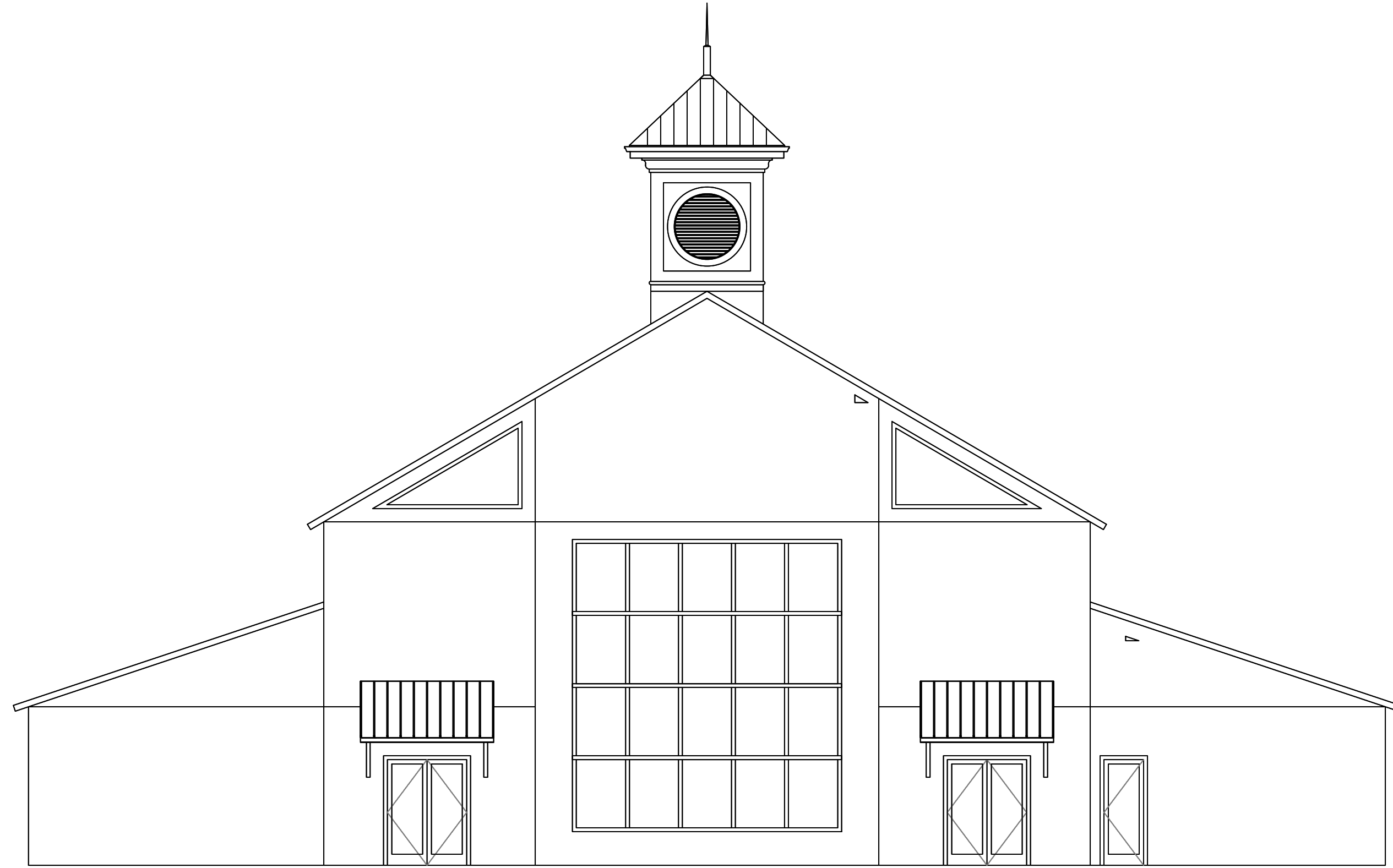
1 REAR ELEVATION 1/8" = 1'-0"